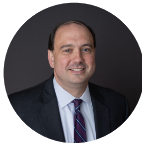
JAMES B. ELDRIDGE State Senator Middlesex & Worcester District